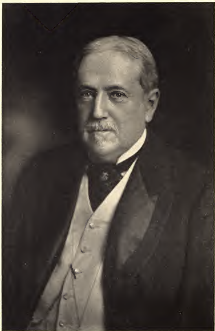
Wm Dudley Foulke